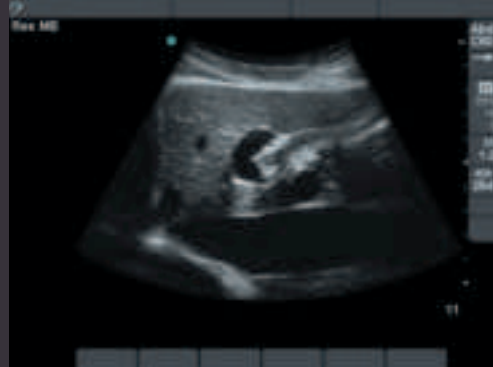
Liver/Aorta, captured using the SonoSite MicroMaxx ultrasound tool and the C60e/5-2 MHz transducer